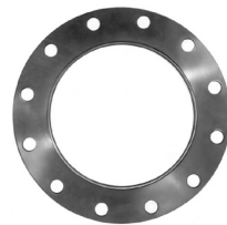
NSF 61 certified Toruseal® Gasket